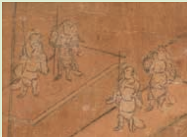
Image of the Shitennō made by Prince Shōtoku himself

The main object of worship at Shitennōji Temple. They are Buddhist deities that reside on Mount Sumeru, at the center of the world, and protect the world from the four directions of east, west, south, and north. Their names are Jikokuten, Zōchōten, Kōmokuten, Tamonten.